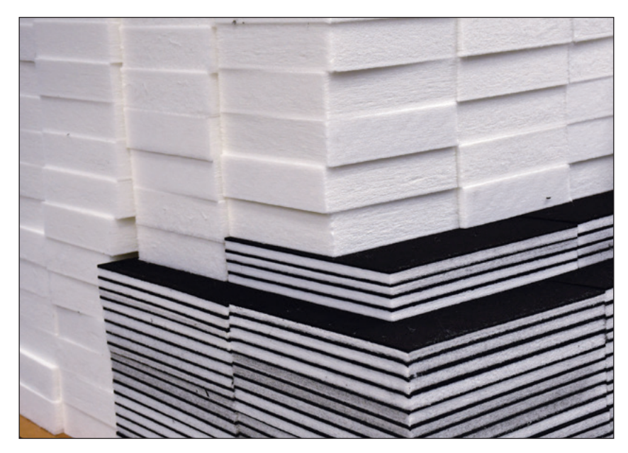
Have material that you need cut to custom sizes? We can help, consult with us today.

High density 11# sheets are also available at \frac{1}{8} " and 9mm. All sheets are at 48" x 96". Please consult sales for other custom dimensions.