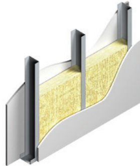
STC 42: steel stud + insulation