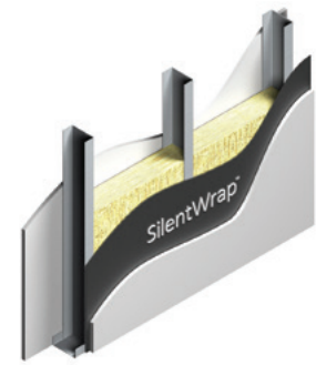
STC 53: steel stud + insulation + SilentWrap