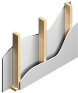
STC 29: wood stud